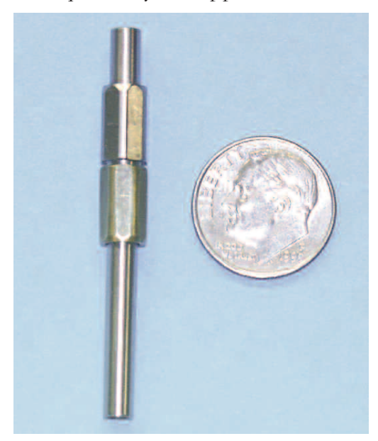
DeepSight® Single Channel

In response to the growing need for fiber optic monitoring systems in oil wells, Amphenol Fiber Systems International (AFSI) has developed the DeepSight® fiber optic connector for use in downhole applications. DeepSight® has the ability to withstand the high pressure, temperatures and corrosive fluids found in down-hole environments. These connectors are precision-machined to stringent tolerances and designed to provide superior optical performance in extreme conditions. Custom version available as required by the application.