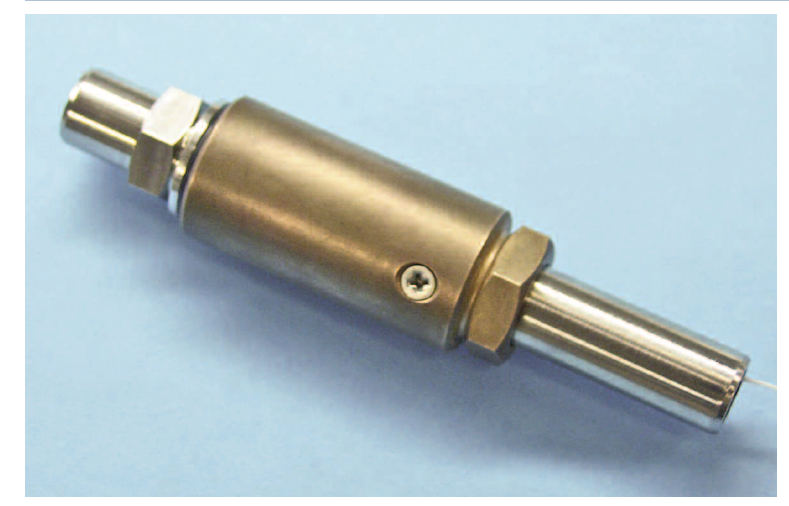
DeepSight® 4-Channel Closed