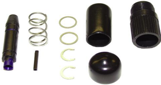
Biconic Connector Assembly